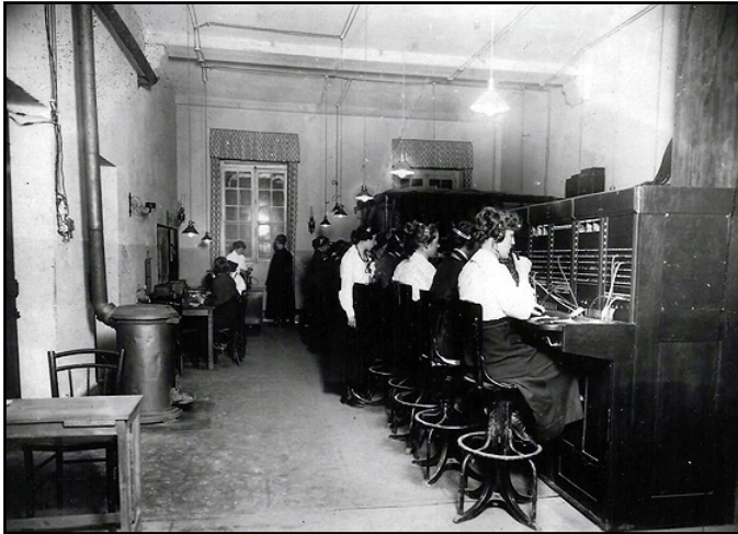
Women operators at the switchboard in the Office of the Chief Signal Officer at the American Expeditionary Forces headquarters in Tours, France, October 17, 1918. U.S. Army Signal Museum, U.S. Army Women's Museum

better off at home, safely away from the fighting. 11 However, during the American Revolution, civilian women traveled with the Continental Army and state regiments. Often the wives of soldiers, they provided support services vital to the well-being of the soldiers, including nursing, cooking, and washing. Their presence was often controversial, and they were usually not official members or employees of the armed forces. This began to change during the Civil War when the Union Army hired women to care for the sick and wounded when there were too few soldiers to do the job adequately. This lesson was forgotten until the Spanish-American War, when the lack of women nurses during the early part of the conflict cost many American lives. When epidemics of typhoid, yellow fever, and dysentery broke out, the U.S. Army had to scurry to hire professional, female nurses as contract employees to care for the sick soldiers. As a result, the U.S. Army Nurses Corps was established in 1901, and in 1916 army nurses were readily available to care for the sick and wounded during the conflict along the U.S.-Mexican border. Although the nurses lacked full army status and rank, when the United States entered World War I, they were sent to France as members of the AEF. However, further increasing the number of