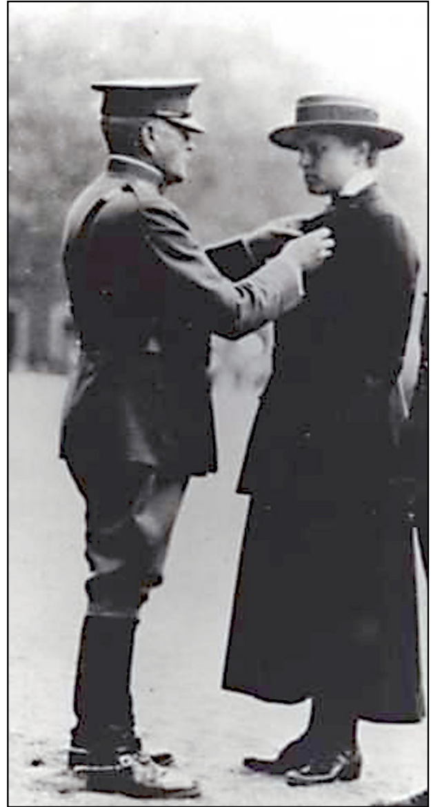
American Expeditionary Forces Commander General John J. Pershing presents a Signal Corps telephone operator with the Distinguished Service Medal shortly after World War I.

Although operating a switchboard in a war zone challenged the idea of the proper role of women during wartime, it should also be noted that the work itself did not otherwise challenge gender roles. The public generally believed that telephone operators, like nurses, were supposed to be female and that women performed that job better than men (a popular perception was that women's fingers were nimbler than men's, for example). Men who were assigned to serve as telephone operators were resistant to the job and often fought to be reassigned. They would not and could not fill the role as well as the women. In the United States almost all telephone operators were women, and men were accustomed to women filling this role in the business world. The fact that a female