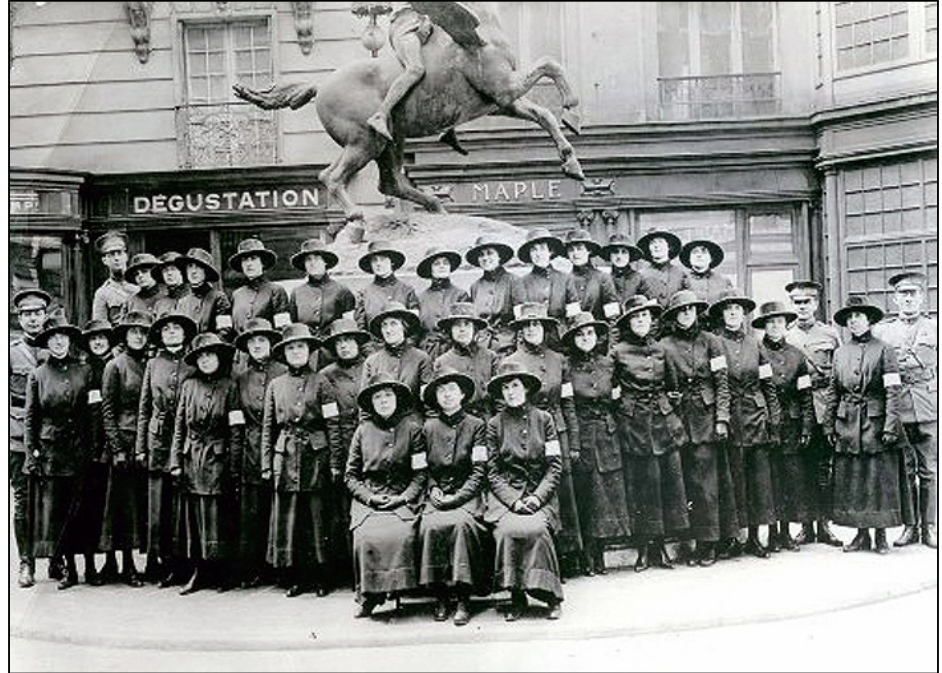
The first unit of Signal Corps telephone operators to arrive in France in March 1918 poses with Signal Corps soldiers. The March 29 edition of the Stars and Stripes newspaper said: "They arrived just the other day, and like everything else that's new and interesting in the Army—yes, they're in it too—they were lined up before a Signal Corps camera and shot. Grouped about the base of a statue in a little Paris square, they presented a pleasing sight. (American girls always do.)"

Over the summer of 1918, the operators' responsibilities expanded and their reputations grew. As well as connecting calls on American lines and between French and American lines, the operators were "translating and routing extremely sensitive information regarding troop movements, supply, logistics, and ammunition between major allied commanders." 32 According to operator Louise Barbour, "When Pershing can't talk to Col. House or Lloyd George unless you make the connection, you naturally feel that you are helping a bit." 33 In spite of the fact that new operators continued to arrive from the United States, there were never enough to completely replace the men. One operator recalled that women were on duty during the day when traffic was the heaviest, and men worked at night when the traffic was slow. 34 Some women worked at offices where codes and cover terms were used. Their work became